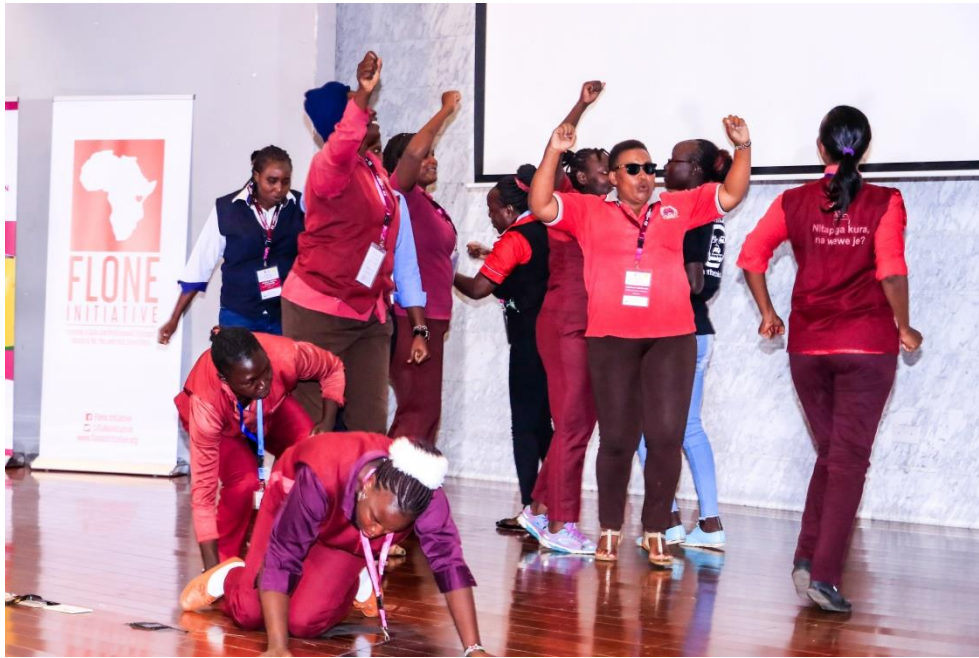
Figure 8: Women working in the matatu industry participating in the play

The play offered a glimpse into the life of Nairobi's Matatu women. Co-created by a group of women working in the Matatu industry, the play was inspired by one woman's perseverance and courage to stand up for herself and others, and follows her journey from a past filled with violence to her redemption as a leader of women's rights in the Matatu industry. From the play, it was evident that women got into public transport out of desperation and necessity to improve their economic wellbeing as opposed to being passionate about working in the sector. They experienced harassment from their male counterparts their passengers and the police. Unions such as ITF have empowered them to report such cases and seek justice.