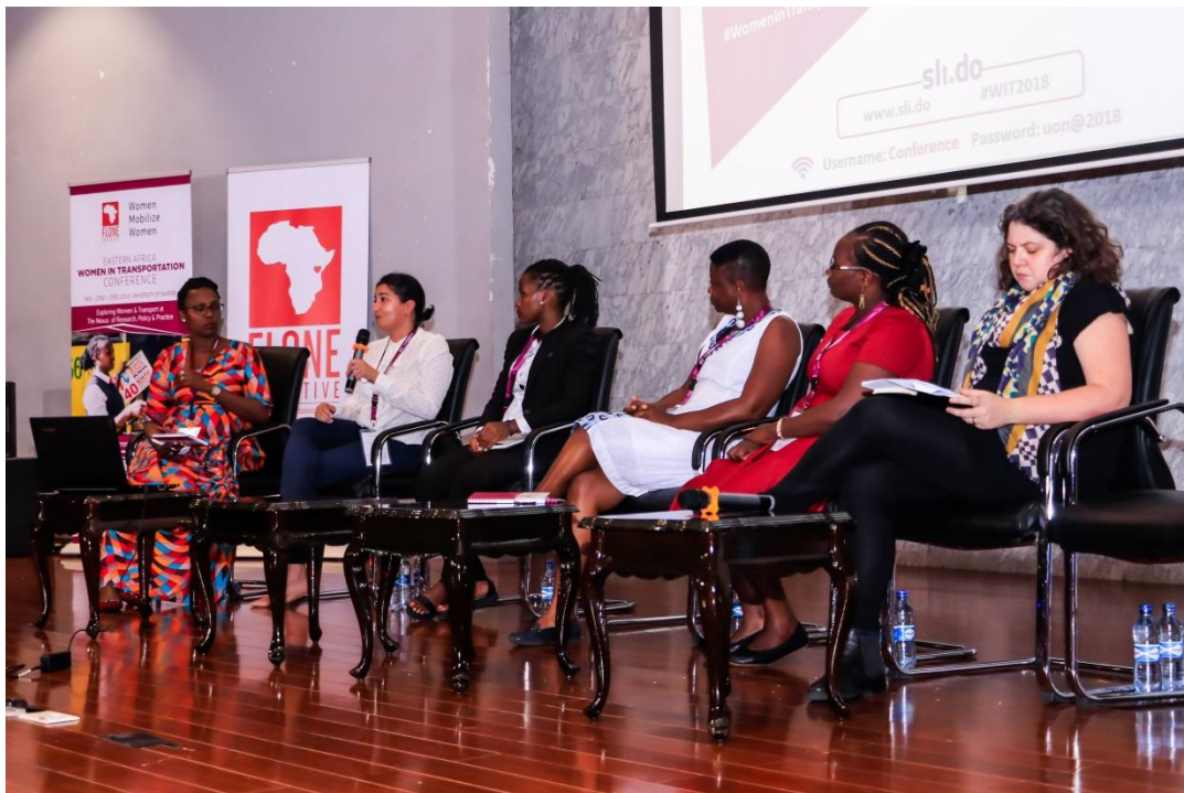
Figure 5: Participants in Panel Discussion: Interventions to Help Women in Transportation

Women in Transport: Creating Knowledge. Improving Transportation Policy. Making Change