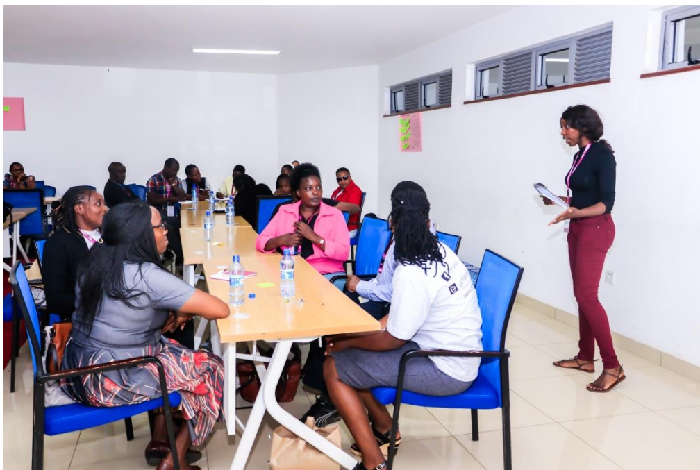
Figure 16: On-going discussions during the practice breakout session