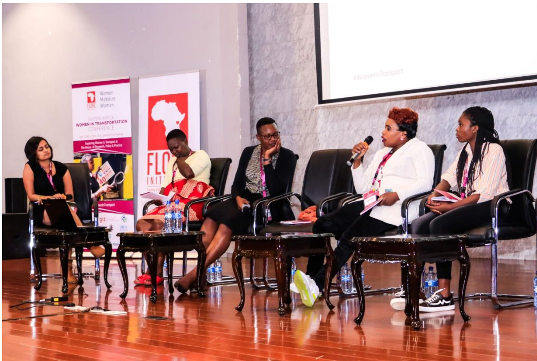
Figure 11: Participants in the Interactive Panel Discussion: Women on the Move