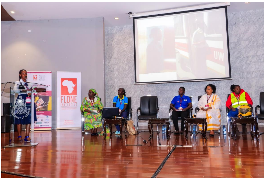
Figure 3: Participants in Interactive discussion: Personal Stories From Transport Workers of Eastern Africa

Women in Transport: Creating Knowledge. Improving Transportation Policy. Making Change