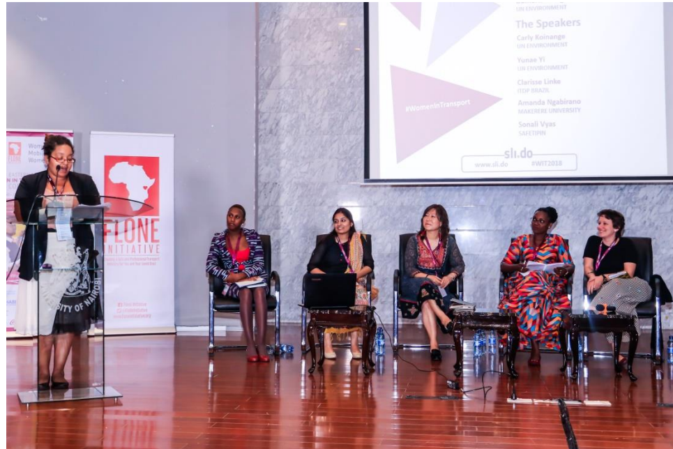
Figure 6: Participants in Interactive Discussion: Gender Mainstreaming in Action

Women in Transport: Creating Knowledge. Improving Transportation Policy. Making Change